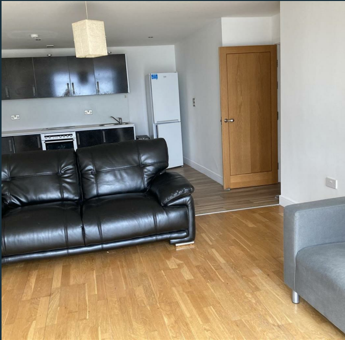
Altolusso, Bute Terrace